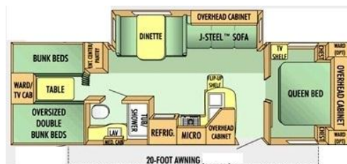
2008 Jayco Jay Flight G2 31 BHS Floorplan

This Jayco Jayflight G2 31' Travel Trailer is in excellent condition and immaculately kept. Living area is open, roomy and has lots of natural light. Interior Height: 81 inches. Complete with stereo surround and outside speakers to listen to music on your patio!